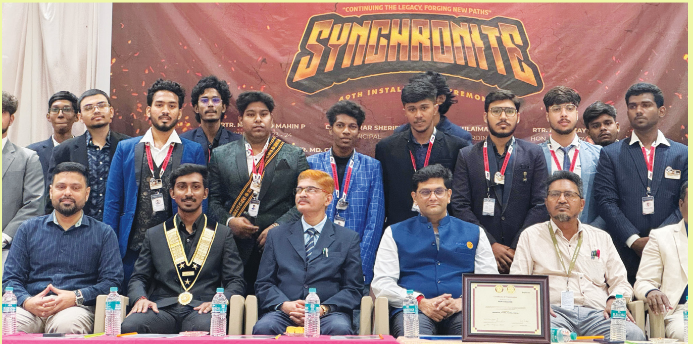
On August 7, 2024, the Rotaract Club of New College hosted its 49th installation ceremony named Synchronite at HAAS Auditorium, New College.